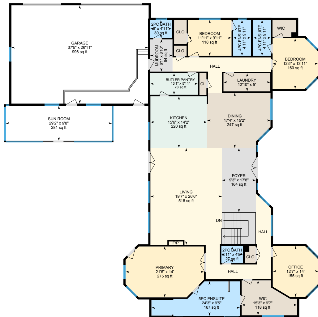
Main Floor Exterior Area 3254.25 sq ft

Main Building: Total Exterior Area Above Grade 3254.25 sq ft