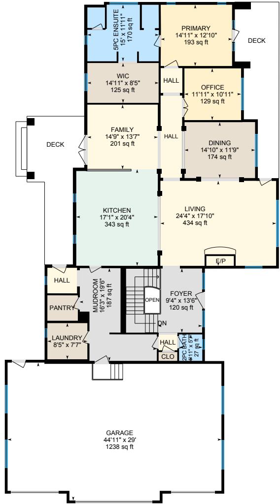
Main Floor Exterior Area 2734.35 sq ft

Main Building: Total Exterior Area Above Grade 2734.35 sq ft