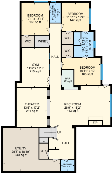
Basement (Below Grade) Exterior Area 2712.36 sq ft